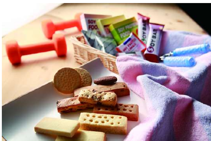
Sugar-reduced cookie bars

The Group proposes and provides food with an excellent nutritional balance by continuing research on delicious plant-based protein ingredients to partially replace the sugar in sugar-rich foods (staple foods and confectionery) with proteins. For instance, by partially replacing the sugar in staple foods, such as bread and cereals, with proteins, it is possible to easily reduce the amount of sugar without sacrificing taste. We contribute to delivering the joy of food and health to consumers by proposing and providing delicious plant-based protein ingredients that can replace these sugars to customers.