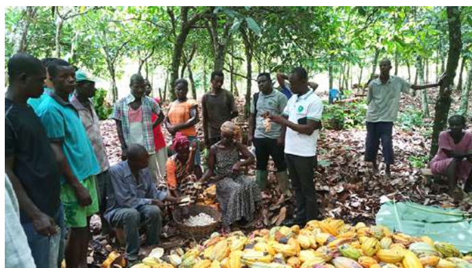
Farming guidance for local farmers

In FY 2019, we began purchasing traceable cacao beans from Ghana in another community. Part of the purchase cost is returned to the community of cacao farmers that produced these cacao beans and is used to increase the income of farmers.