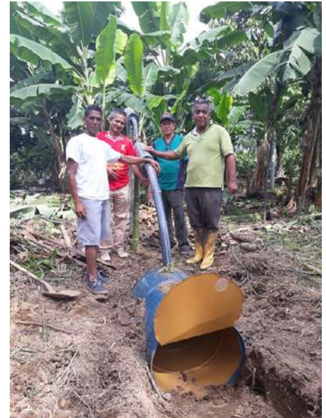
Local farmers receiving technical guidance to make an organic insect repellent spray with a low burden on the soil and on cacao

Based on the Responsible Cacao Sourcing Policy, in December 2018 we started activities to support smallholders in Ecuador, in collaboration with the Group's direct suppliers. Our objective is to improve the productivity and quality of cacao beans, and raise the living standards of farmers and communities by providing farming support and education. Currently, our direct suppliers provide training to 68 farmers on farm management methods, soil management, and post-harvest processes (fermentation, etc.). The quality of the cacao beans largely depends on soil management, production practices and post-harvest processes. In FY 2019, our farming program helped to increase the yield per area unit by 5%, at farmers receiving support. This is expected to increase farmers' income. We will also work to improve the quality of cacao beans by conducting flavor research on site.