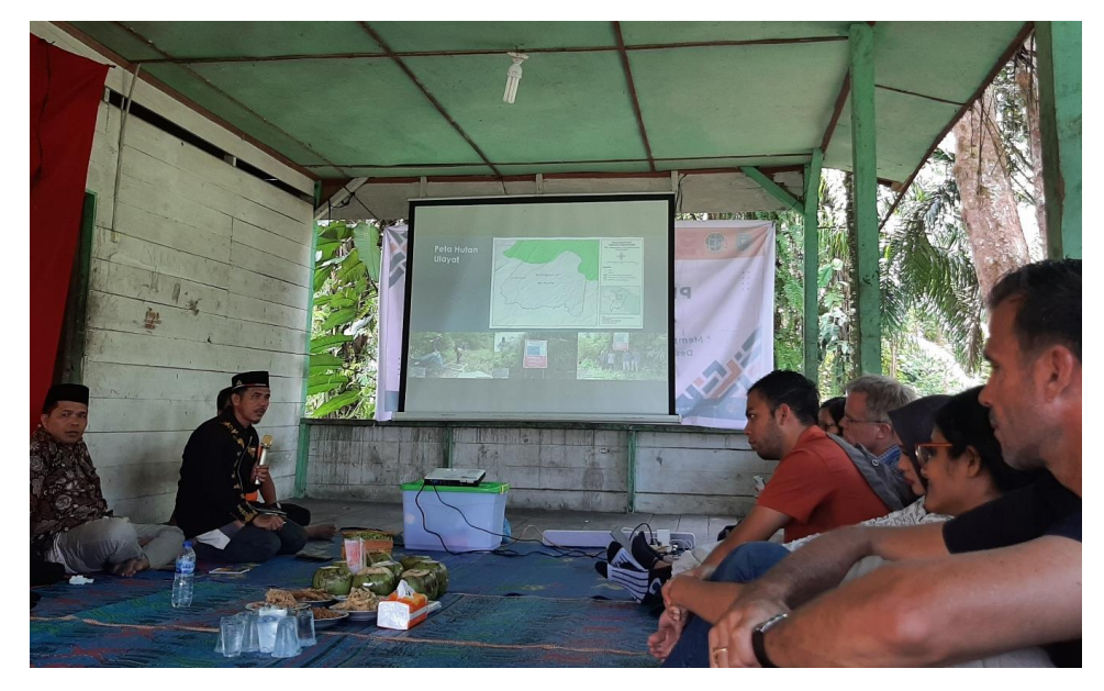
Discussion on customary rights and conflict resolution on land tenure rights