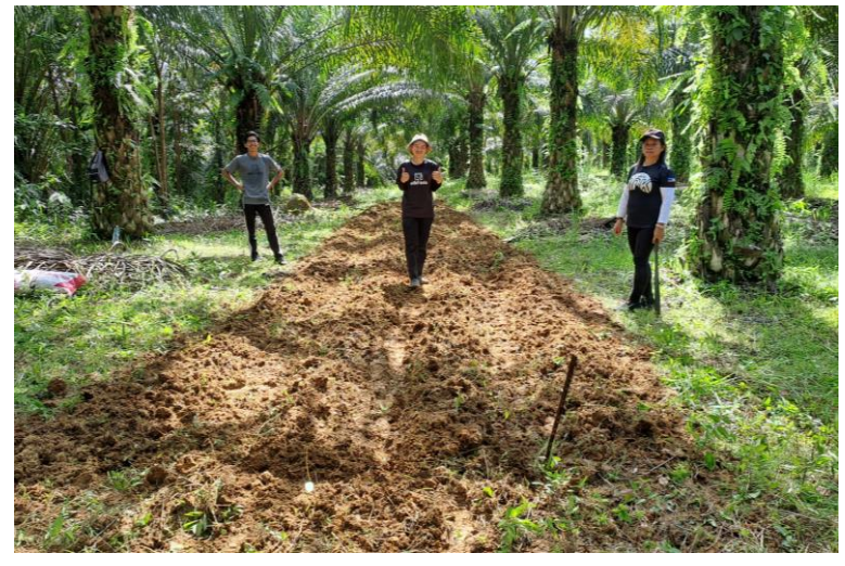
Wild Asia helping WAGS BIO farmers to prepare farms for ginger intercropping

Wild Asia visiting and engaging with potential BIO