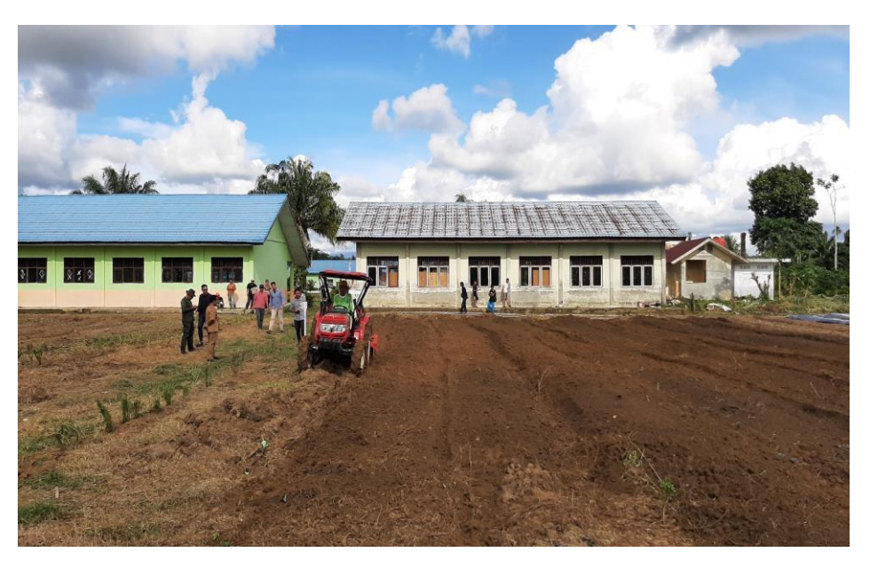
Learning ecosystem from farming practices to crop businesses