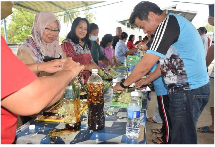
Workshop participants on making fruit enzymes