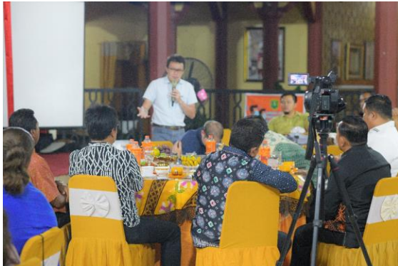
Dinner and dialogue with Subulussalam Government