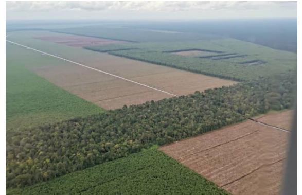
Animal corridor between timber plantations