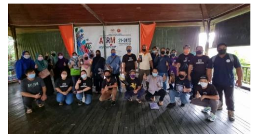
One of WAGS BIO workshops held at Kinabatangan