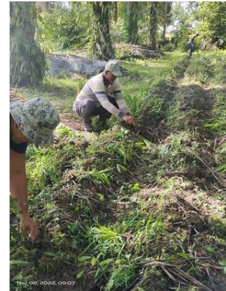
Wild Asia field officer is guiding and helping WAGS BIO farmer to do ginger intercropping

In WAGS BIO Project , total number of BIO farm, which fulfill criteria established by Wild Asia, reached 20 in Sabah, as of May 2022. Not only continuous engagement to optimize farmer's income and yield while reducing chemical inputs, but also new pilot initiative have been implemented to generate biochar by oil palm fronds to use it as input for soil health. 10 farms have participated the biochar pilot program. The team also compiling field data to analyze the impact of BIO farm method.