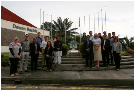
Dialogue with Malaysia Palm Oil Board on TTP collaboration