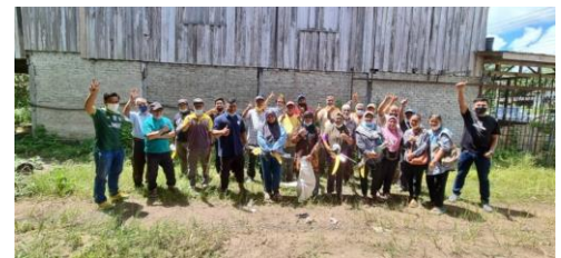
WAGS RSPO certified farmers