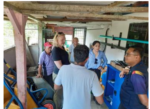
Visit to smallholder farm and facility